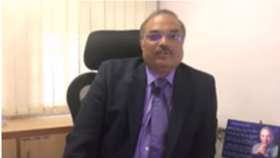
> 2. Video Bytes: Framing the picture - Key business factors