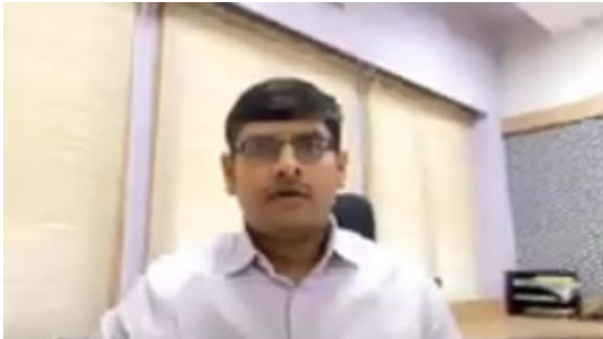
> 3. Video Bytes: Framing and leveraging hypotheses through key themes