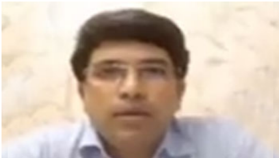
9. Video Bytes: Understanding the safety & health criteria