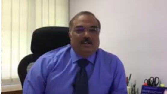
> 1. Video Bytes: Deriving insights from application document