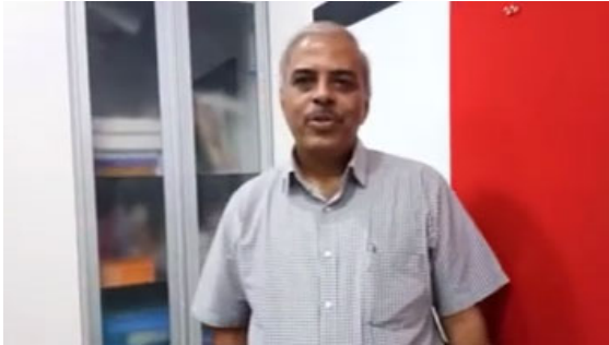
7. Video Bytes: Learning from the pyramid to frame NERDs