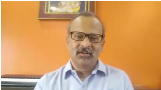
> 4. Video Bytes: Leveraging line of inquiry in Assessments