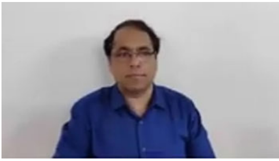
5. Video Bytes: Understanding process maturity the ADLI way