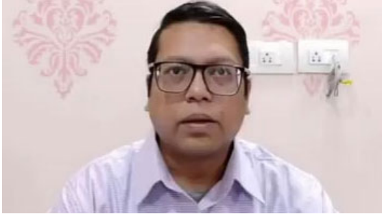
6. Video Bytes: Comment writing through NERDs